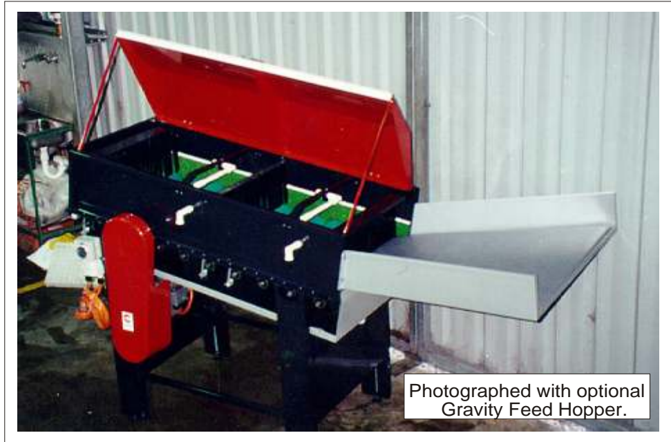
Photographed with optional Gravity Feed Hopper.