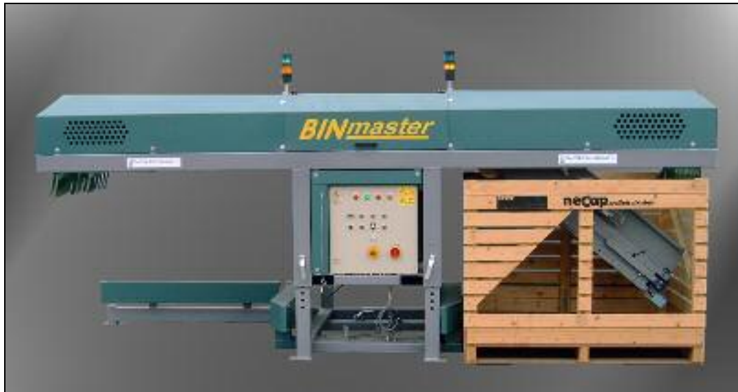
BINmaster® – Automatic double binfiller for multiple bin sizes

Telefoon : +31 (345) 58 53 00 Telefax : +31 (345) 58 53 10 E-mail : info@propak.nl Internet : www.propak.nl