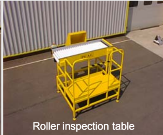
Roller inspection table