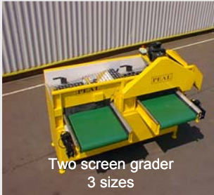
Two screen grader 3 sizes