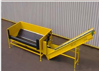
Hopper feed elevator