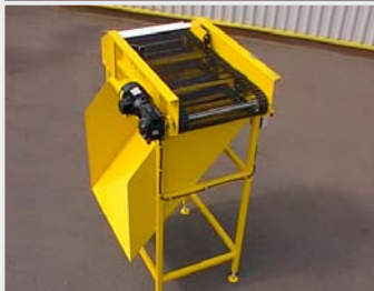
Web soil extractor