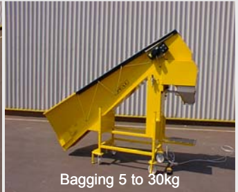
Bagging 5 to 30kg

Washing machinery is part of a comprehensive range of quality vegetable handling equipment from Tong Peal Engineering